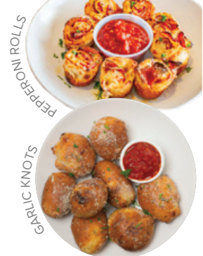
PEPPERONI ROLLS GARLIC KNOTS