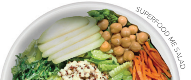
SUPERFOOD ME SALAD

mixed greens, tomatoes, red onion, red and green peppers, cucumber and mozzarella cheese. served with housemade Italian dressing.