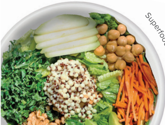
Superfood Me Salad